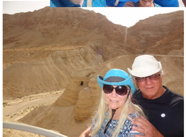
Qumran, site of the discovery of the Dead Sea Scrolls. Behind us is Cave 4 that housed a treasury of ancient manuscripts.

Left & Below: 2 Kings 20:20 “As for the other events of Hezekiah’s reign, all his achievements and how he made the pool and the tunnel by which he brought water into the city...” As a defense against the Assyrian army King Hezekiah accomplished this amazing engineering feat to bring water from Gihon spring into Jerusalem. Our team waded through the pitch black winding tunnel for 45 minutes. It lies under 140 feet of solid rock and at times narrows to less than shoulder width.