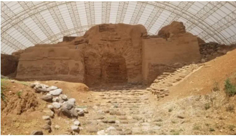
Tel Dan—Abraham's Gate

Left:—Tel Dan in Northern Israel was discovered just a few years ago and the archeologist uncovered this amazing city gate to the ancient city of Dan. It is the oldest intact arch in the world. The most amazing thing however is to stand in front of this gate and realize that this is the very gate that Abraham and his men passed through over 4000 years ago. The event is recorded in Genesis 14.