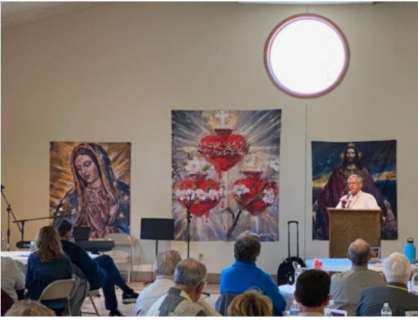
Life in the Spirit Seminar—Denton, Nebraska 53 attended the event.