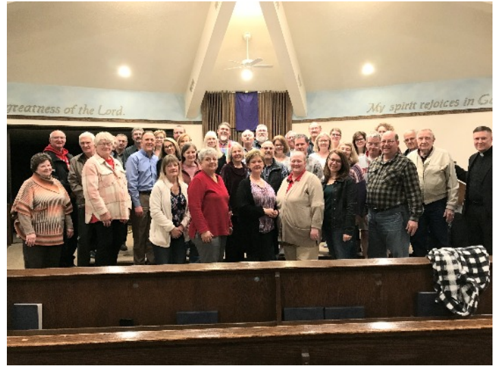
Lenten Parish Mission, St. Mary's, Denton, NE