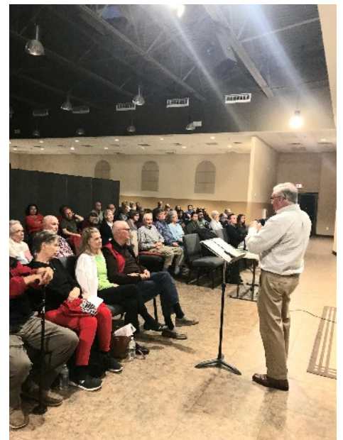
Parish Mission, Buckeye, AZ