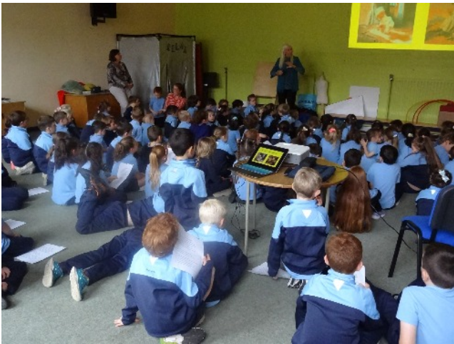
Teaching the wee ones—"How can I be Like You, Jesus?"—Ireland Elementary School