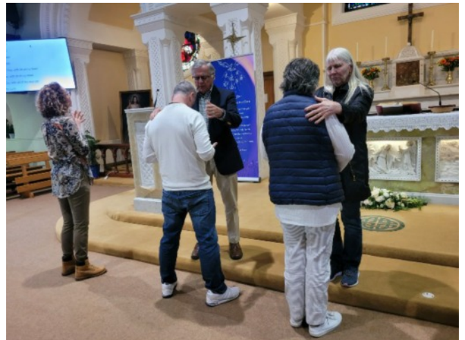
Left & Above: Encountering Christ as Lord—Kilkerely, Ireland