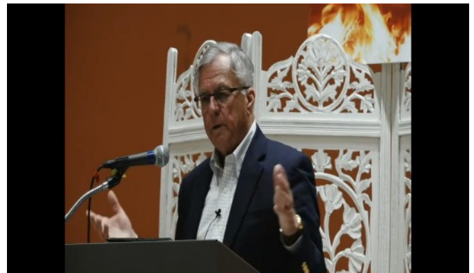
January, 2023— Holy Spirit Healing Conference, Gainesville, FL