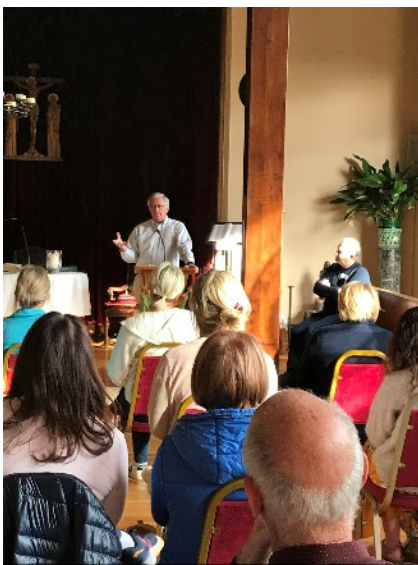
Life in the Spirit Seminar—Benburb, Ireland retreat Center