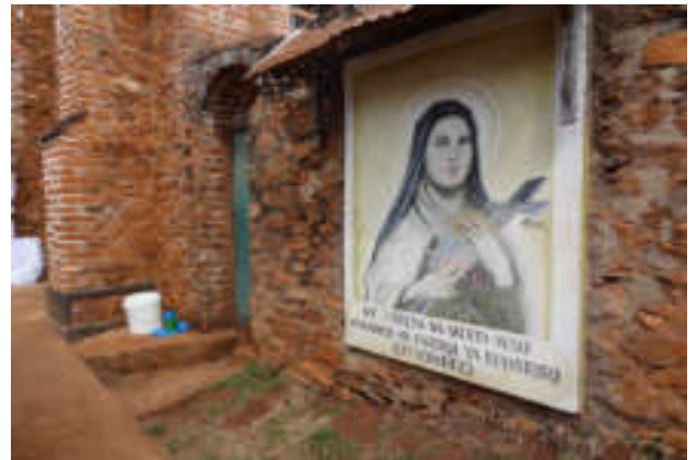
Our Rally platform erected on the steps of Ngarahohoro Parish—oldest church in the Diocese, dedicated 1931.