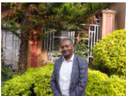
Salve, Dar es Salaam, Tanzania