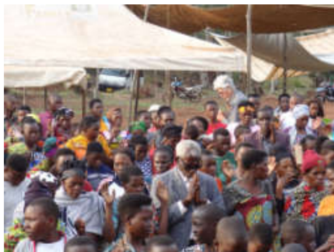
Team members praying with others