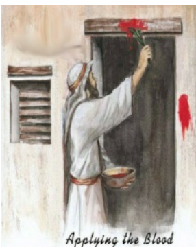
Applying the Blood

Exodus passage, we read about how God instructed his people to take an action which would protect them from an invisible force, a destroying angel, which would wreak death on any household that did not comply. This action seems illogical to human thinking. It was a step in obedience according to sheer faith. Follow the imagery and view it through the eye of faith.